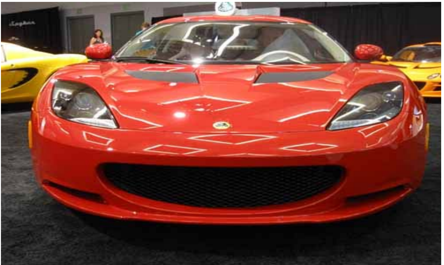
Red Lotus Evora at the 2009 L.A. Auto Show